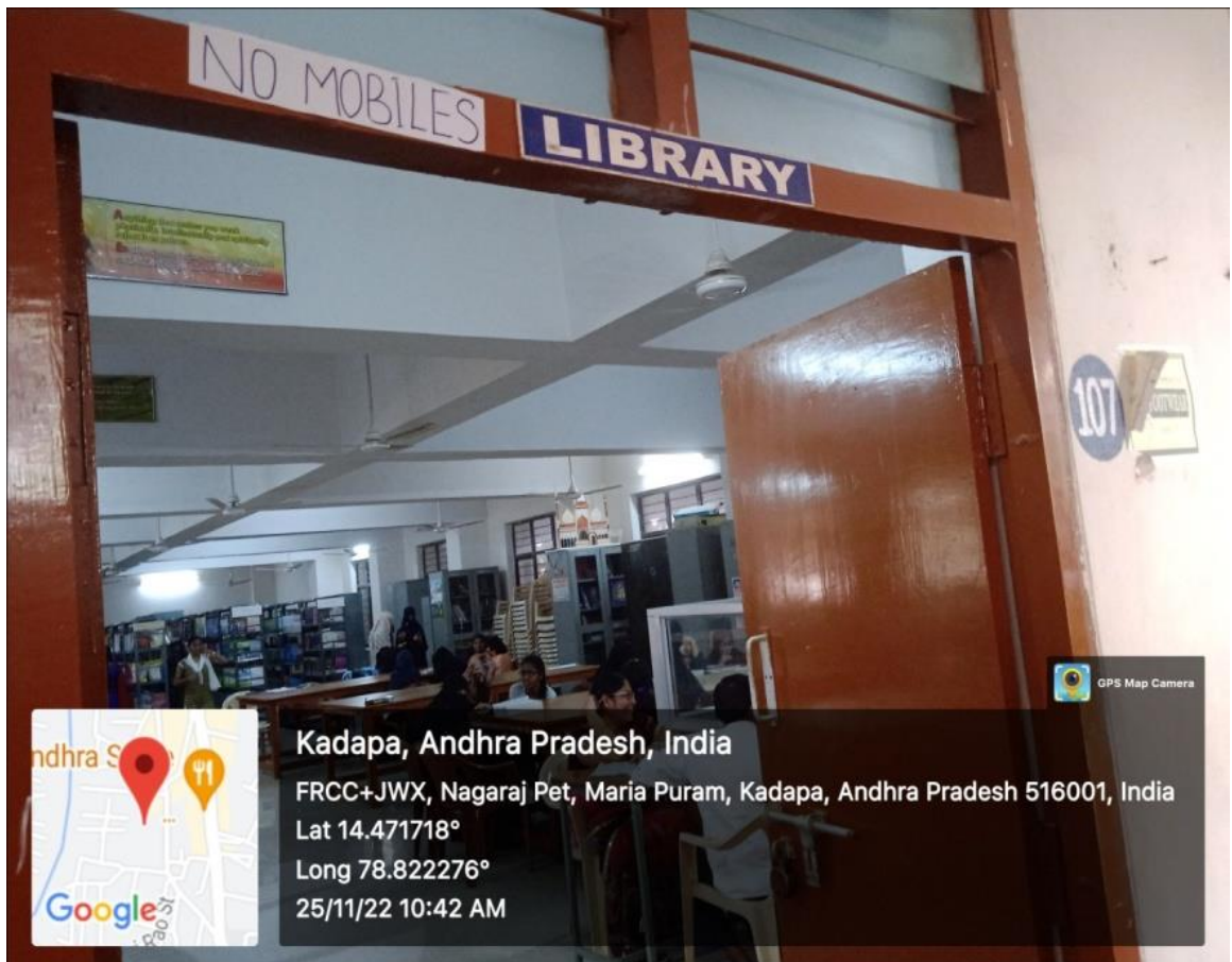
No Mobiles entry into the Library