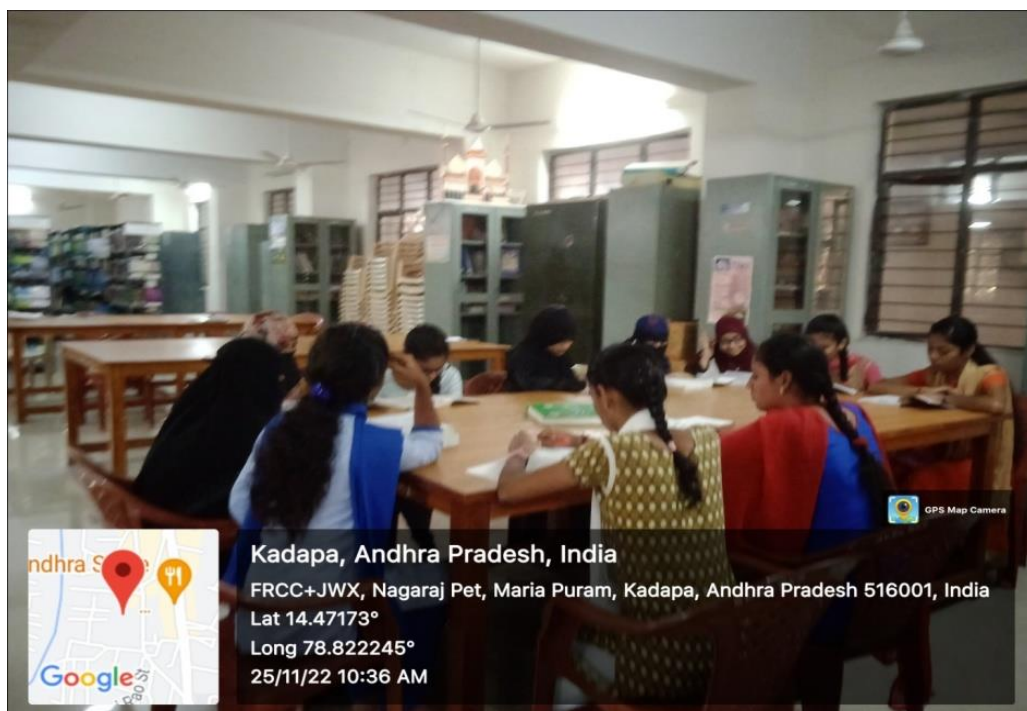
Silent Reading in the Library